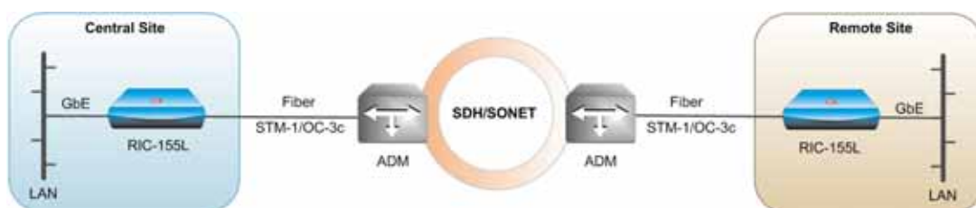
Figure 2. Point-to-Point Ethernet Private Line over SDH/SONET

Temperature: 0 to 50°C (32 to 122°F) Humidity: Up to 90%, non-condensing