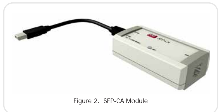
Figure 2. SFP-CA Module