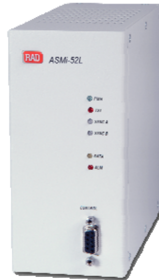
Rail-mount Metal Enclosure

Dedicated managed SHDSL modem for 2-wire and 4-wire service over any copper infrastructure