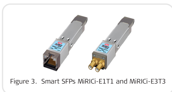
Figure 3. Smart SFPs MiRiCi-E1T1 and MiRiCi-E3T3

Integrated management of MiRiCi smart SFPs provides TDM (E1/T1/E3/T3/OC-3/STM-1) connectivity over PDH or SDH legacy networks. ETX-203A supports configuration and statistic collection for the smart SFP TDM port.