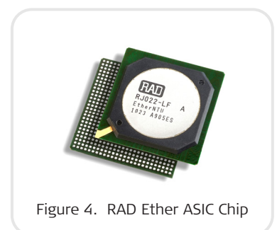
Figure 4. RAD Ether ASIC Chip